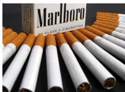
Topic of the week: (Click for details)